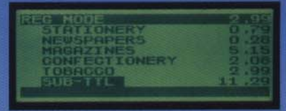
Reports and journal can also be viewed on this screen.