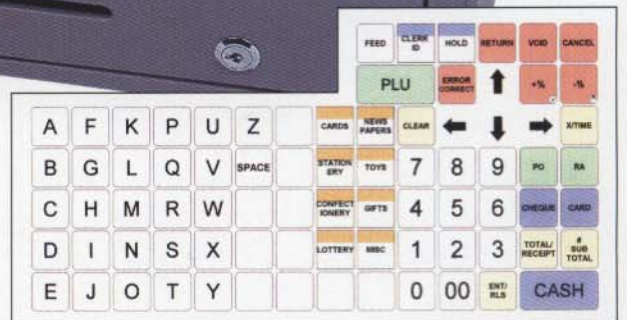
Choice of flat keyboard.

SMART ECR SYSTEMS THAT DO MORE – COST LESS