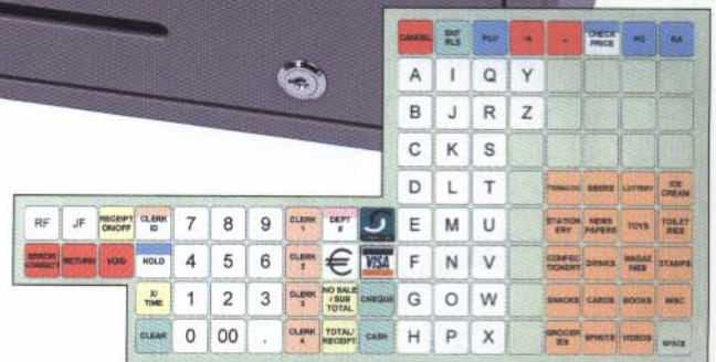
Option of flat keyboard

SMART ECR SYSTEMS THAT DO MORE – COST LESS GELLER ELECTRONIC CASH REGISTER SYSTEMS